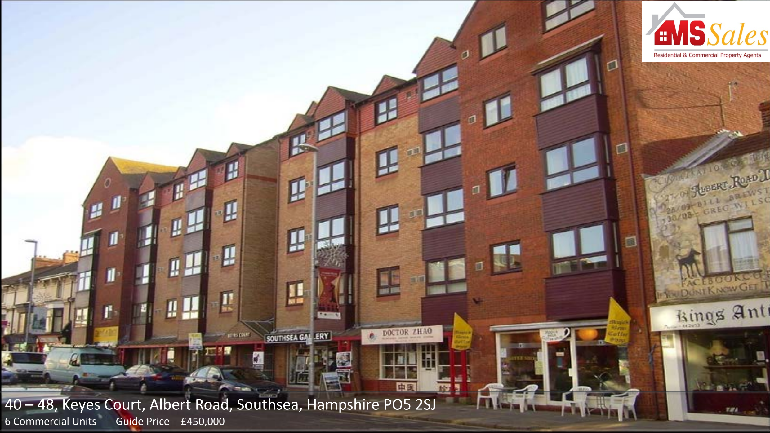
40 – 48, Keyes Court, Albert Road, Southsea, Hampshire PO5 2SJ 6 Commercial Units - Guide Price - £450,000